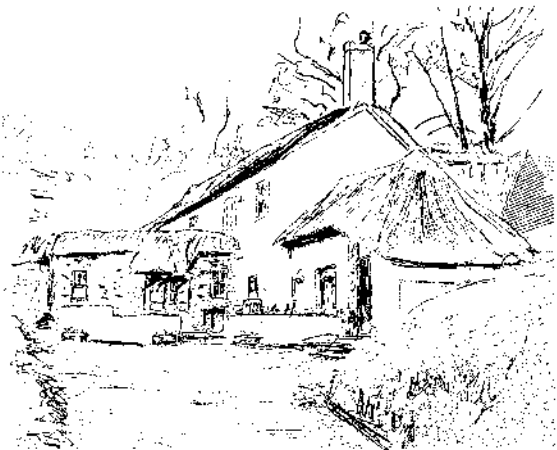
Royal Oak - alas no more